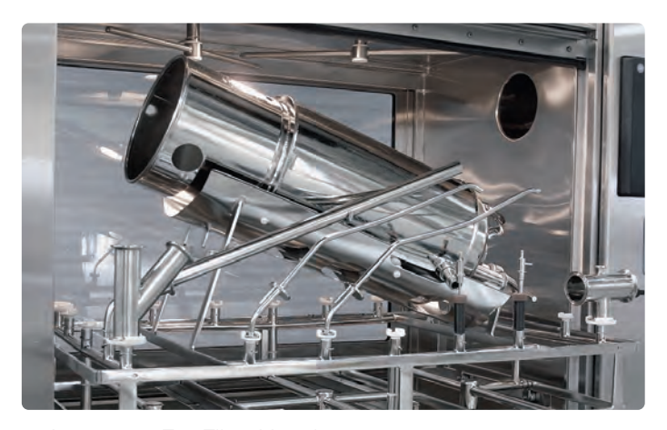
Accessory For Filter Housing