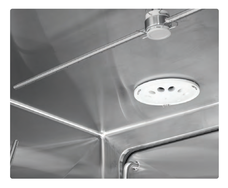
Monitors chamber spray arm rotation to help ensure all external surfaces of the load items are exposed to the cleaning process