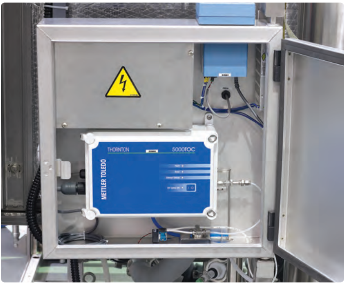
Monitors Total Organic Carbon (TOC) in final rinse water to help ensure expected cleaning and rinsing results are consistently achieved