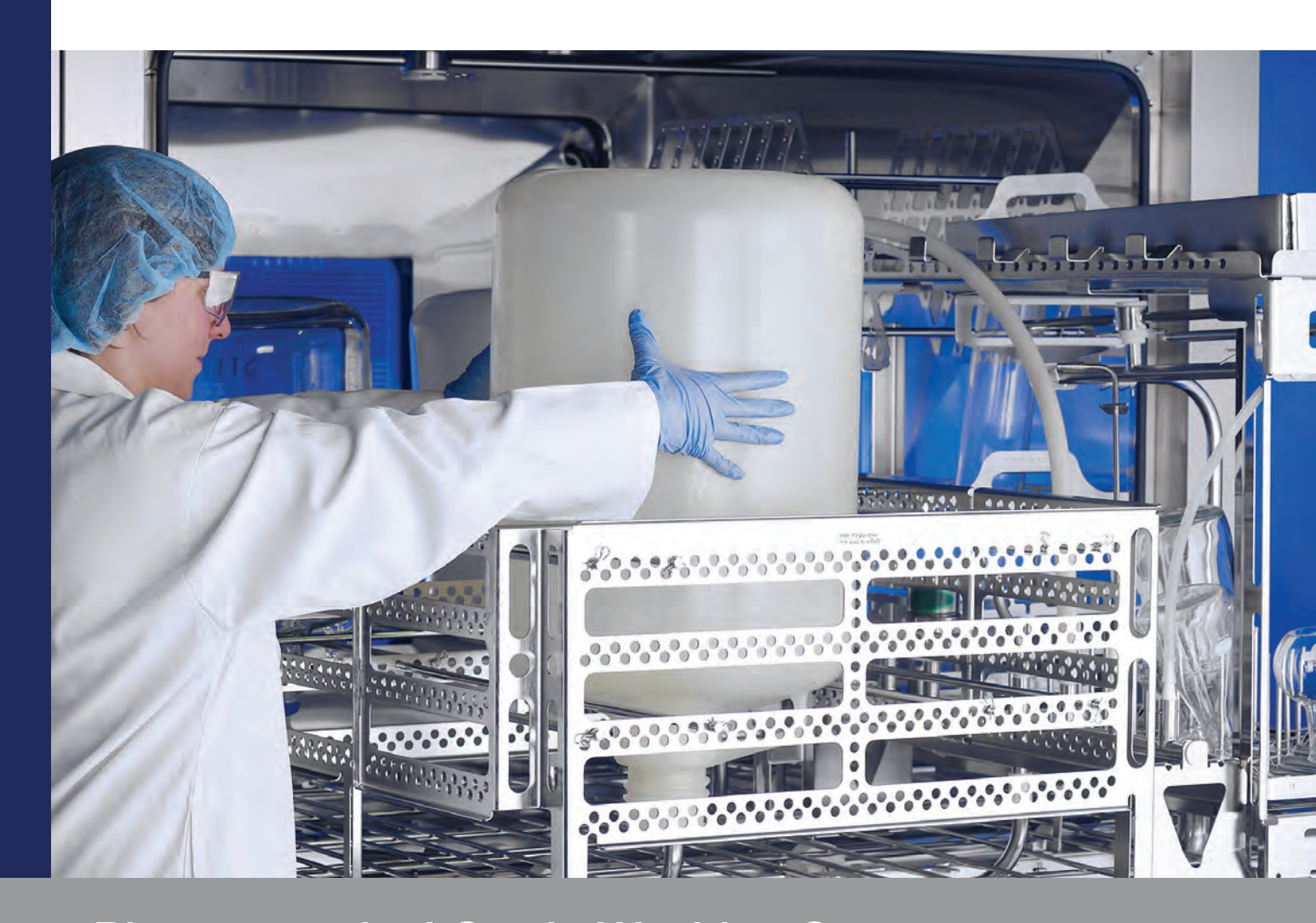
Pharmaceutical Grade Washing Systems