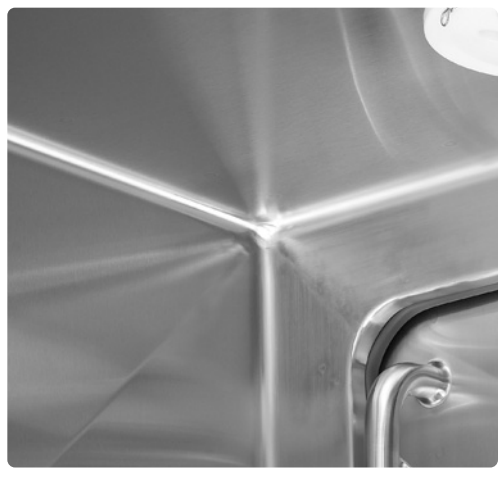
Designed with large chamber corner radius