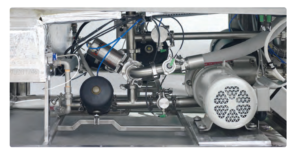
Meets BPE 2016 requirements with 2% slope for all piping and flat surfaces, as well as maximum 3D dead legs with the majority at 2D

Increasingly stringent regulatory standards require industry expertise and attention to details. The new PG series Pharmaceutical Grade Washer was designed with such features in mind: