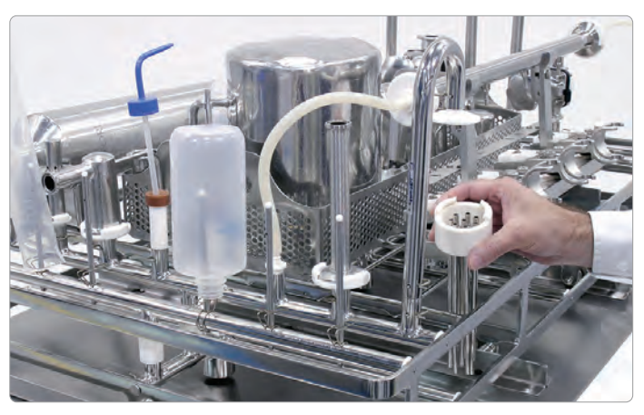
Part Washing Accessory